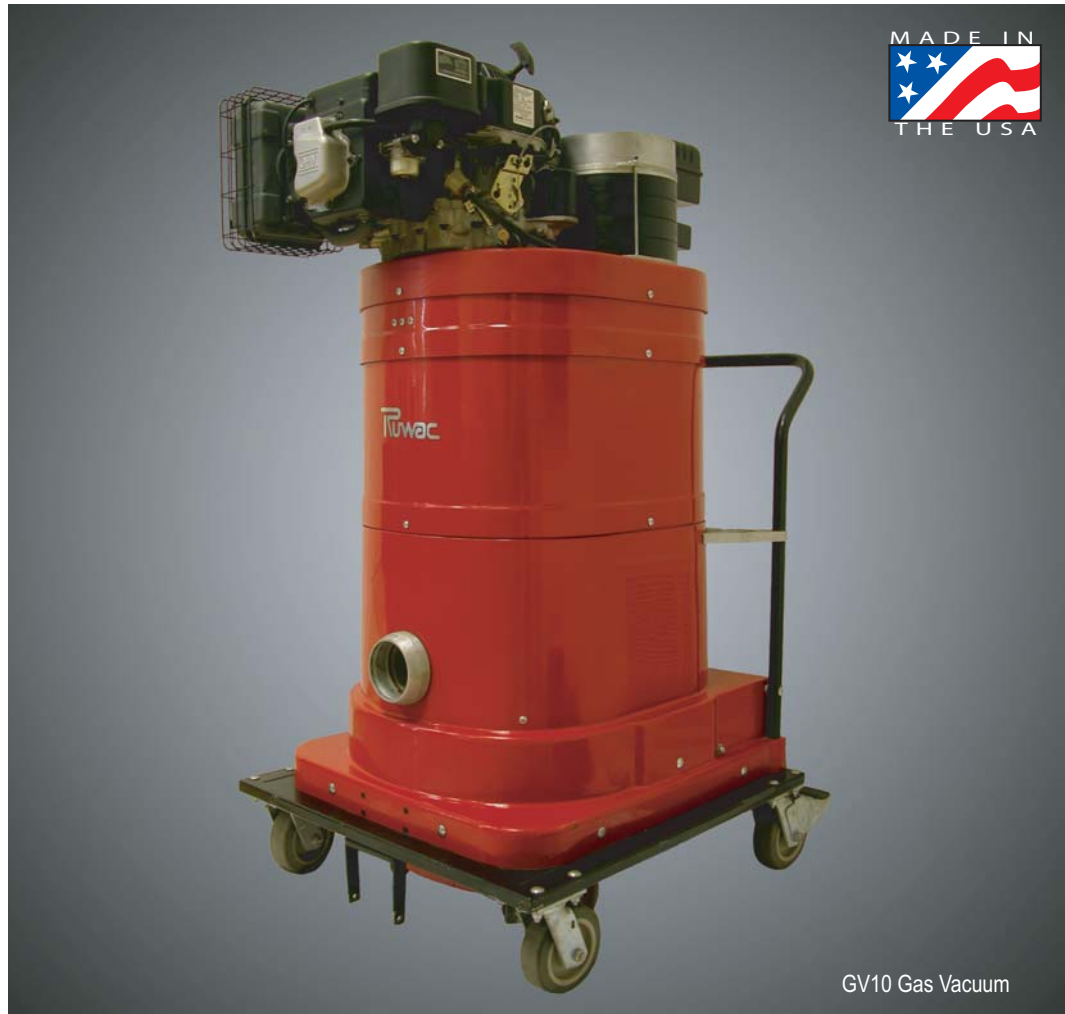
GV10 Gas Vacuum