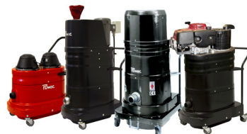
Portable Vacuum Systems