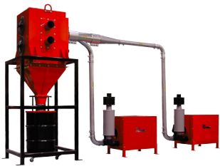
Central Vacuum Systems