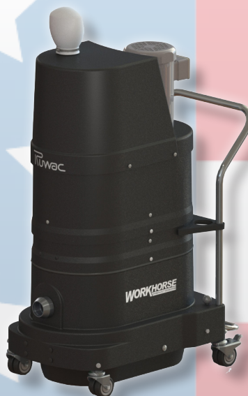
Range Vac 301