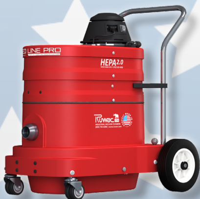
Range Vac 101