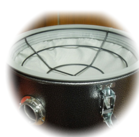
1 Micron primary filter for efficient fine dust collection