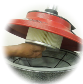
HEPA option available for absolute filtration