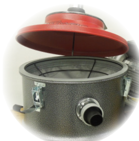
Easy access lid for quick, sanitary material removal